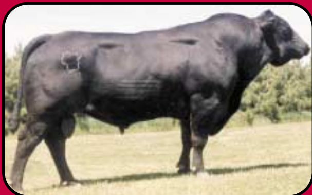
GT Expo (Angus) ABS Global