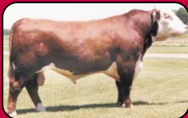
Huth Homerun (Polled Hereford) ABS Global