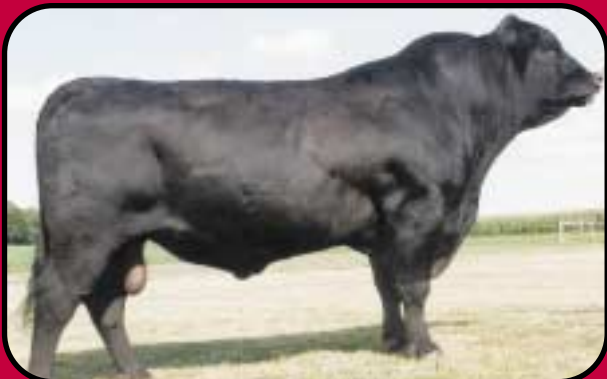
GT Maximum (Angus) ABS Global