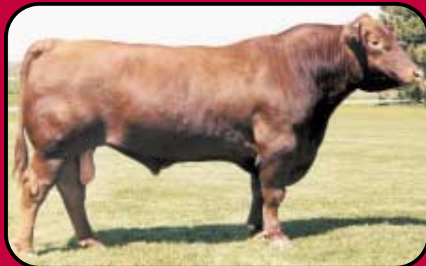
RBJR Advance 709 (Red Angus) ABS Global