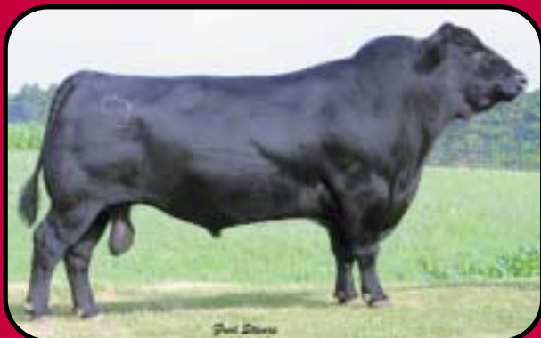
Mill Coulee 6809-243 (Angus) Accelerated Genetics