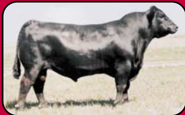
Fountains Fortress (Angus) Accelerated Genetics