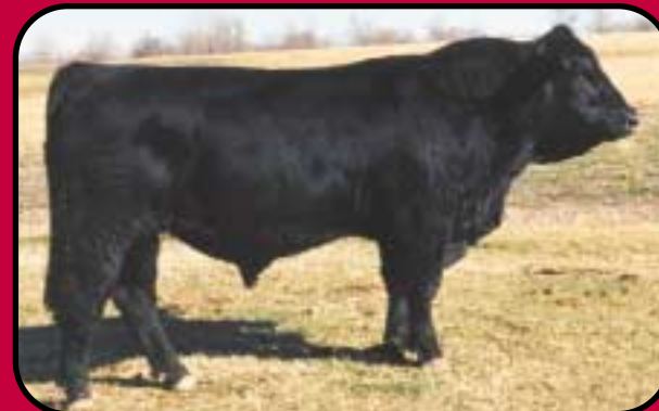
RW Bomber (Simmental) NBI