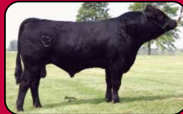
RW Big Mike (Simmental) Select Sires